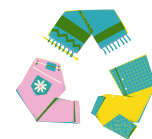
Other reusable textiles/materials