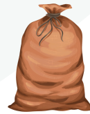
Feed bags / grain bags